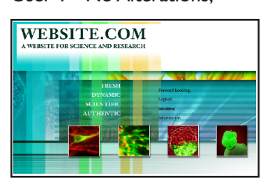
FOAC data available in alt/hover tags on graphic areas.